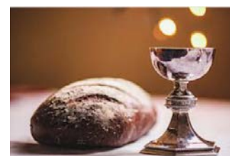
The chalice for wine and the bread to break.