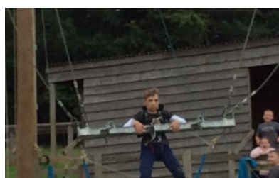
The Giant Swing