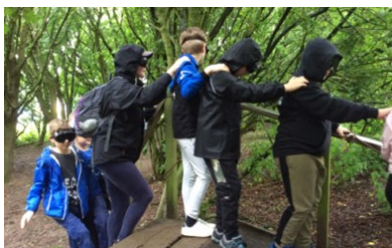
The Sensory Trail