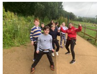
Team 3 Loving Life