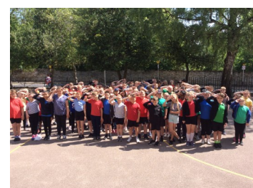
Armed Forces Day